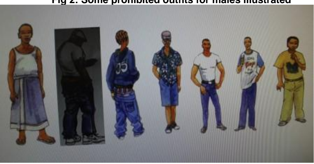
Fig 2: Some prohibited outfits for males illustrated

Figure 3: Prevailing public service Dress code. (Also applicable to EASTC)