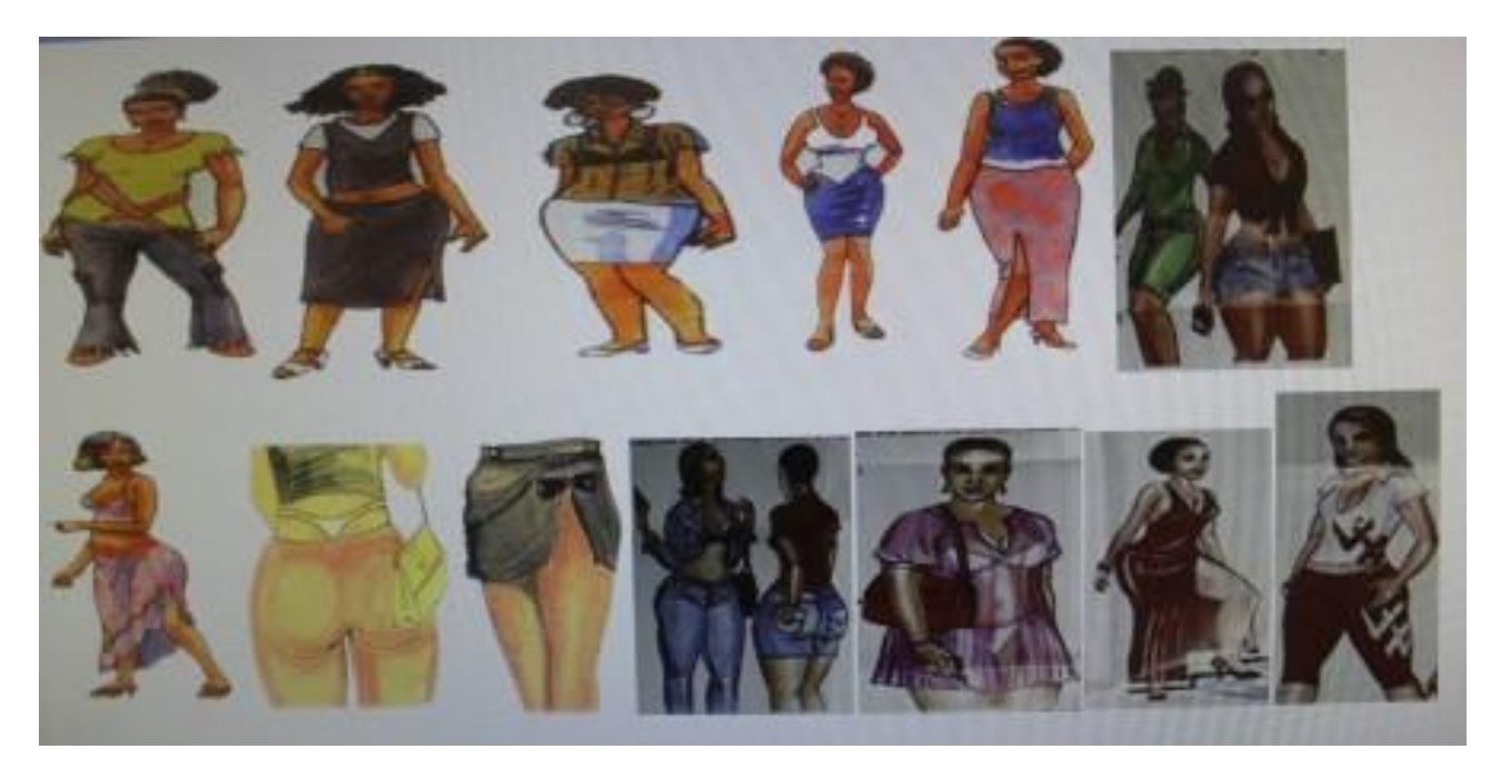
Fig 1: Some prohibited outfits illustrated